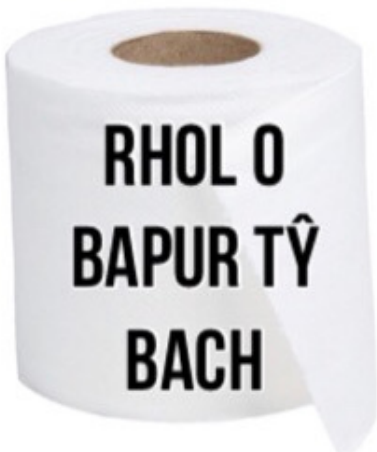
RHOL O BAPUR TŶ BACH