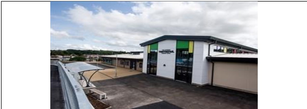
External view of Tonyrefail Community School.

The school site and building are fully compliant with the Equality Act 2010 . As part of the significant investment at Tonyrefail Community School, there was a particular focus on enhancing the onsite and offsite traffic management arrangements, including improved staff parking and the creation of a dedicated home to school transport drop off area.