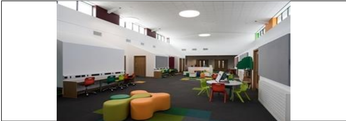
Heart space at Tonyrefail Community School.