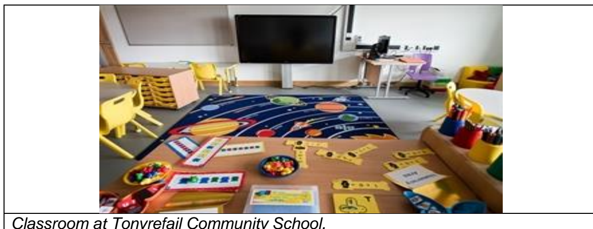
Classroom at Tonyrefail Community School.

The images that follow show Tonyrefail Community School.