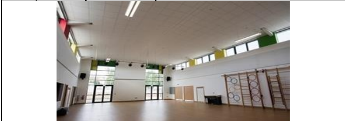
Hall at Tonyrefail Community School.