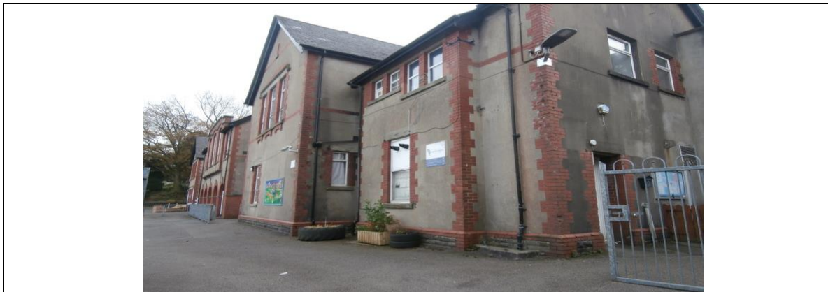
External view of Tref-Y-Rhyg Primary School.

The site itself and the school building does not fully comply with the Equality Act 2010 and is graded D for accessibility, meaning there are significant issues with access.