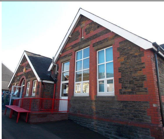
External view of Trallwng Infants' School.

The site itself and the school building does not fully comply with the Equality Act 2010 .