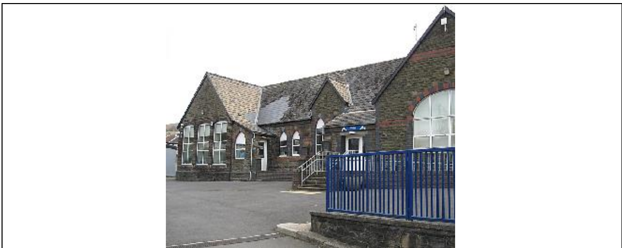
External view of Coedpenmaen Primary School.

The site itself and the school building does not fully comply with the Equality Act 2010 as Coedpenmaen Primary School as a rating of B meaning it is partly compliant.