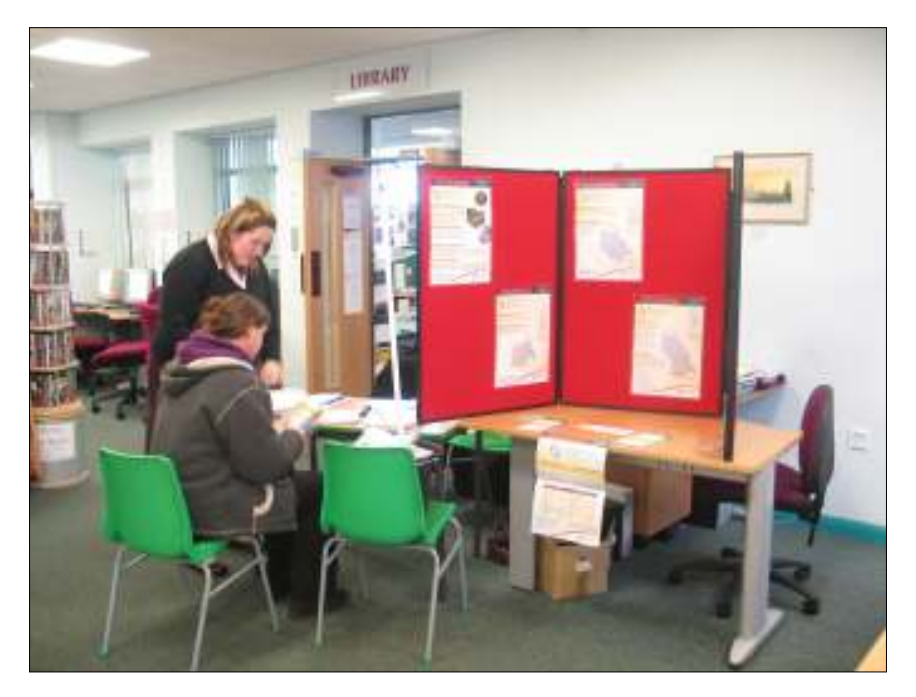
Preferred Strategy exhibition at Treorchy Library

During the consultation period exhibitions were also held in Hirwaun, Mountain Ash, Tonyrefail and Treorchy Libraries and Llanharan Drop-in Centre. The aim was to engage with local people and raise public awareness / stimulate interest in the Preferred Strategy in the local community.