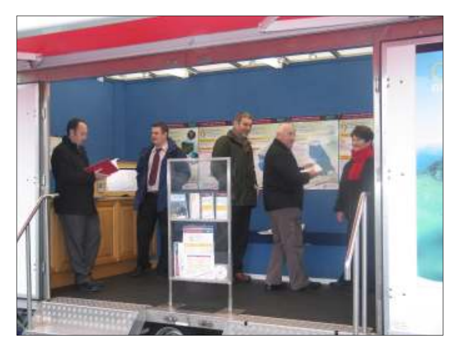
Preferred Strategy mobile exhibition at Talbot Green

2.7 Mobile Exhibitions were held in Pontypridd on the 17<sup>th</sup> and 18<sup>th</sup> January, in Aberdare on the 24<sup>th</sup> and 25<sup>th</sup> January, in Llantrisant on the 31stJanuary and 1<sup>st</sup> February, in Tonypandy on 7<sup>th</sup> February and in Tylorstown on the 8<sup>th</sup> February 2007.